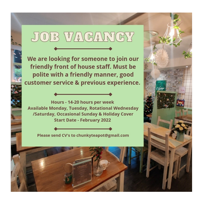
Aspire Pharmacy - Blood Tests

One of our local pharmacies Aspire Pharmacy located at 23 High Street Sidcup offer NHS and Private blood tests between 8.30am-2pm.